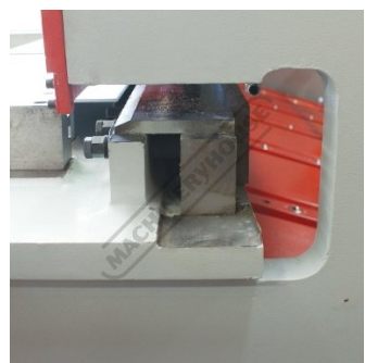
Open Throat for Slitting