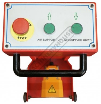
Pneumatic Sheet Support and Emergency Stop on Mobile Foot Control