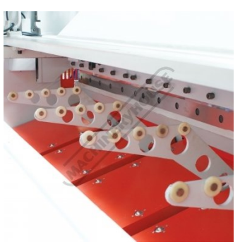
Shown with Optional Pneumatic Sheet Supports