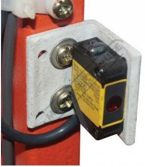
Safety Omron E3ZS Rear Light Sensor Guarding