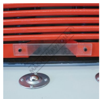
Hand Safety Access