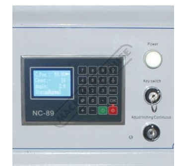
Ezy Set NC 89