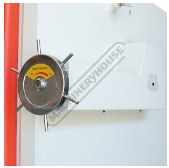
Blade Clearance Adjustment Handle Thickness of Plate Indicator