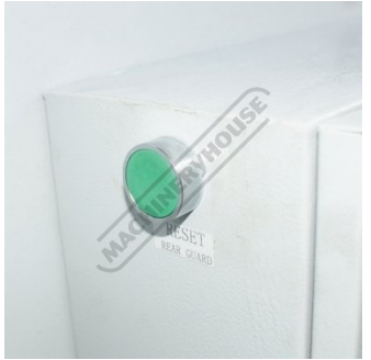
Rear Guard Reset Button