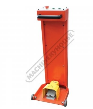
Mobile Foot Control