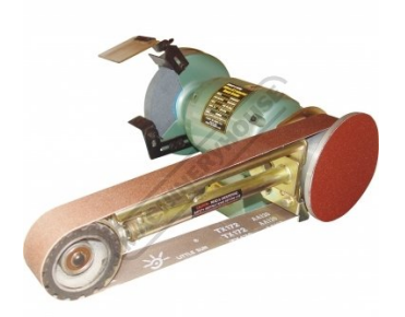
Shown Fitted to a Optional Bench Grinder