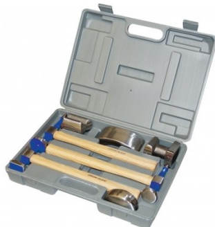
H885 Auto Panel Restoration Kit - DIY