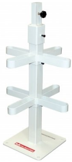
S2238 Steel Dolly Stand