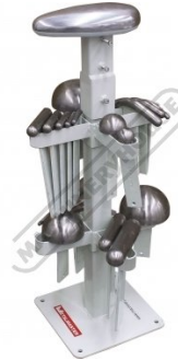
Stand Shown With Optional Dollies