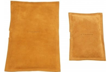
S212 Rectangle Leather Bags - Sand Filled