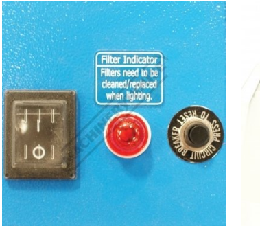
Filter replacment Indicator