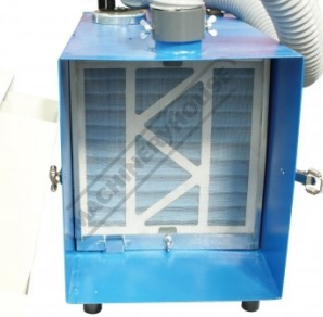
Easy Access to Filter