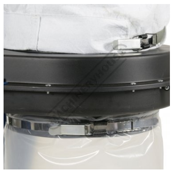
Quick Action Clamps