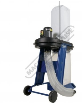
Rear Low View