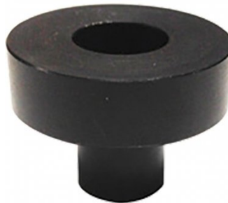
W08012 BuildPro V-Block Spacer