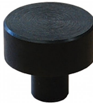
W08000 BuildPro Rest Button