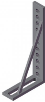
W08088 BuildPro Right Angle Bracket