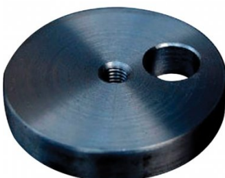
W08026 BuildPro Ecentric Pad