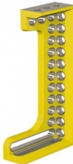
W08111 BuildPro Malleable Cast Iron Clamping Square