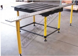
Use to Extend the Length or Width of the BuildPro Table