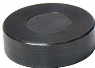
W08030 BuildPro Magnetic Rest Button