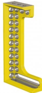
W08110 BuildPro Malleable Cast Iron Clamping Square