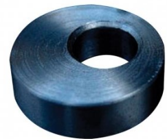
W08024 BuildPro Ecentric Pad