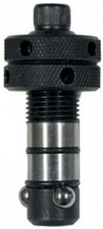
W08048 BuildPro Ball Lock Bolt