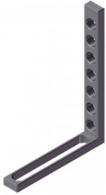
W08087 BuildPro Right Angle Bracket