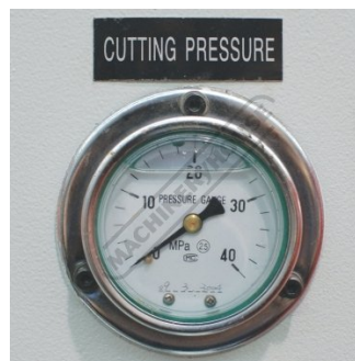
Cutting Pressure Gauge