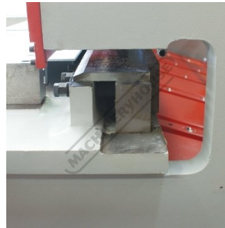
Open Throat for Slitting