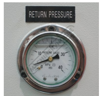
Return Pressure Gauge