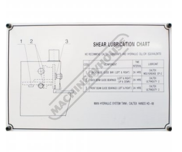
Machine Lubrication Chart