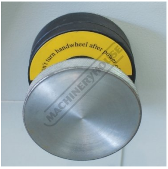
Fine Adjustment Dial for Backgauge