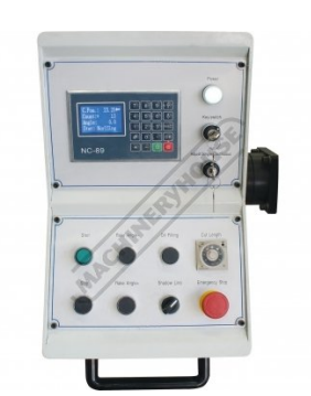
Controller with NC 89