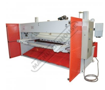
3 Safety Electronic Sensors