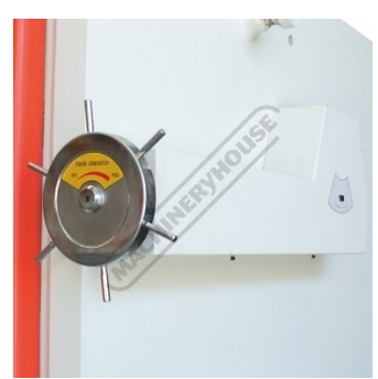
Blade Clearance Adjustment Handle Thickness of Plate Indicator