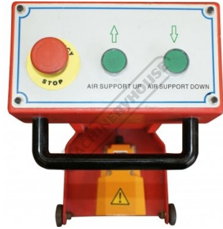
Pneumatic Sheet Support and Emergency Stop on Mobile Foot Control