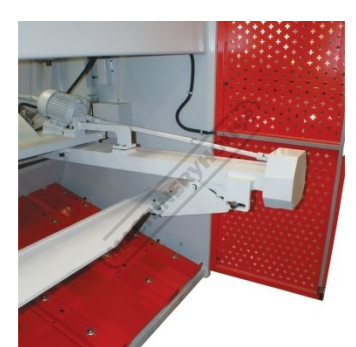
Motorised Backgauge System