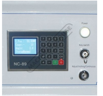
Ezy Set NC 89