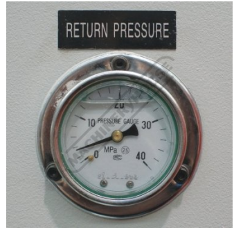
Return Pressure Gauge