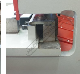
Open Throat for Slitting