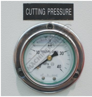
Cutting Pressure Gauge