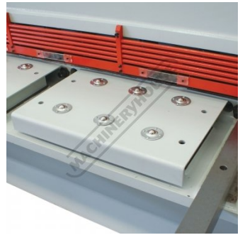
Material Transfer Balls