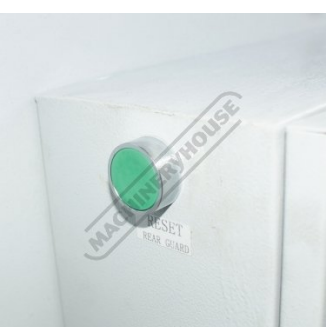
Rear Guard Reset Button