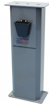
G182 Bench Grinder Stand