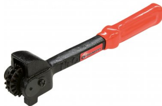
G189A Grinding Wheel Dresser - Rotary Cutter Type