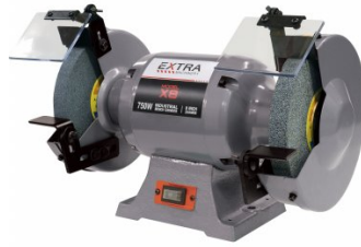
G159 Industrial Bench Grinder