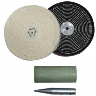
G185 Buffing Kit