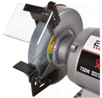
Adjustable Eye Shield-Tool rest