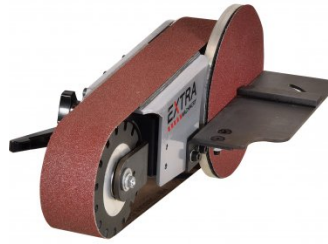
L0910 Industrial Belt & Disc Linishing Attachment