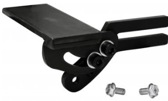
L0914 Work Table Linishing Attachment