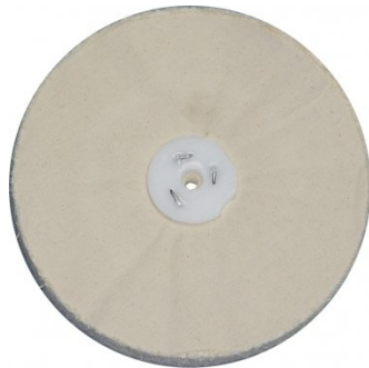
G186A Buffing Mop