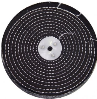
G186 Buffing Mop