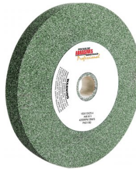
G170 Silicon Carbide Grinder Wheel