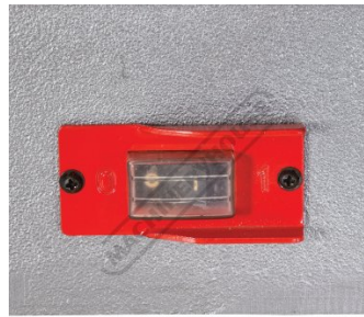
Switch With Dust Cover