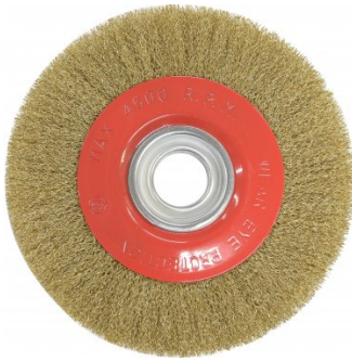
G188 Grinder Wire Wheel - Crimped