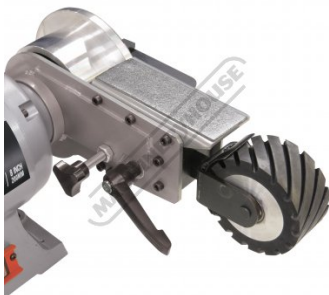
Shown Without Belt