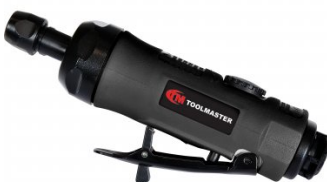
A040 Air Die Grinder