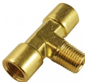
F880 Air Fittings