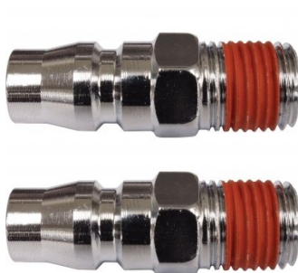
F951 High-Flow Air Fittings