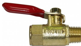
F930 Air Fittings