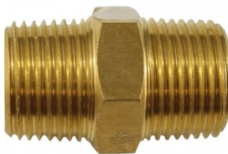
F864 Air Fittings