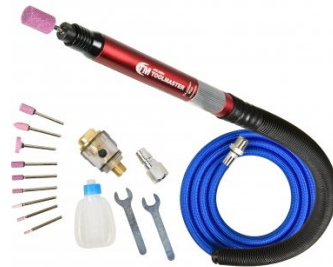
A043 Air Micro Die Grinder Kit