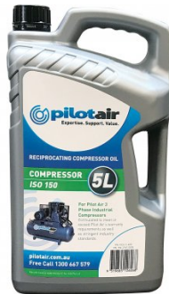
C346 ISO 150 Air Compressor Oil