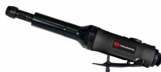
A041 Air Die Grinder - Extended Shaft 5" (127mm)