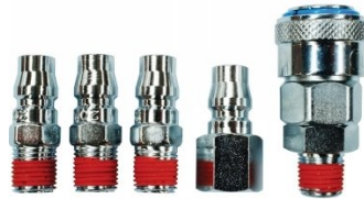
F935 High-Flow Air Fittings