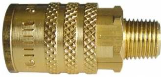
F901 Air Fittings