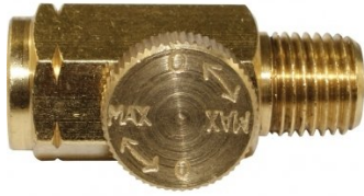
A219 Air Fittings