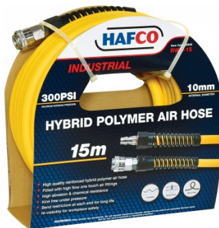
H008 Industrial Polymer Air Hose