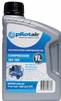
C347 ISO 100 Air Compressor Oil