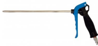
A251 Hi Flow Air Duster Gun