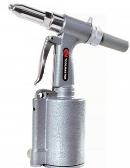
A046 Air Pop Rivet Kit