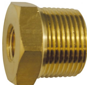
F838 Air Fittings