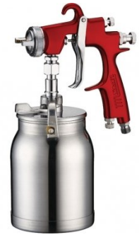
S320 Suction Spray Gun & Pot