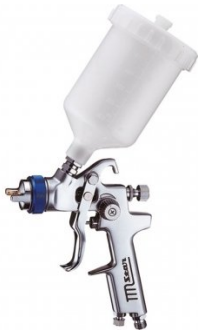
S317 Gravity Feed - Spray Gun