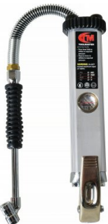
A264 Professional Tyre Inflator with Linear Gauge