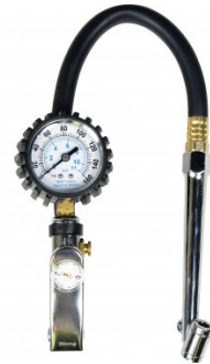
A259 Tyre Inflator with Dial Gauge