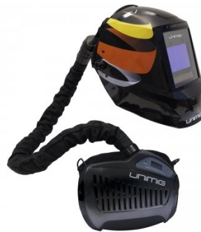
W159 Auto Darken Welding Helmet with PAPR Respiratory System - 5-9, 9-13 Shade