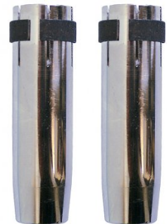
W564 2 x Conical Nozzles