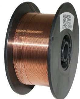
W140 Ø0.8mm Mild Steel MIG Welding Wire