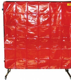
W225 Welding Curtain