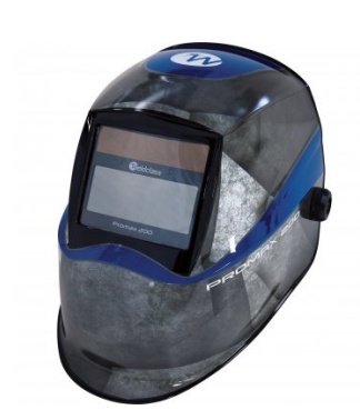
W002 Auto Darken Welding Helmet -9~13 Shade