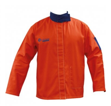
W1001A Promax Blue FR Welding Jacket