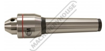
Live Centre Side View