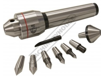
Set Shown With Tips