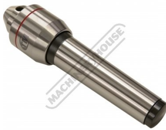
Live Centre Rear View