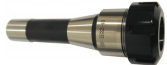
C106 Collet Chuck - R8 x ER32