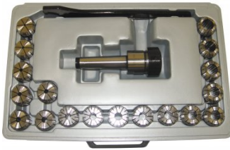
C927 Collet & Chuck Set - 20 Piece