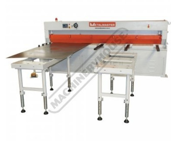
Shown with Optional Ball Transfer Tables - Order Code (L840)