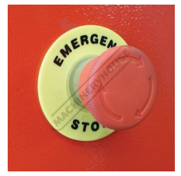
Emergency Stop Switch