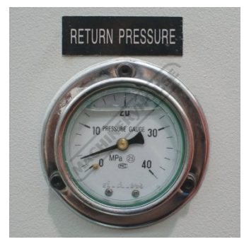
Return Pressure Gauge