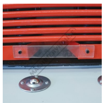
Hand Safety Access