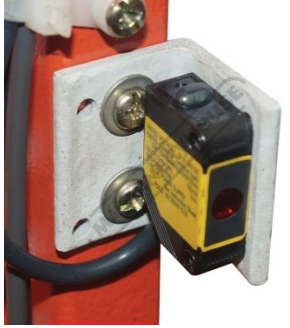
Safety Omron E3ZS Rear Light Sensor Guarding