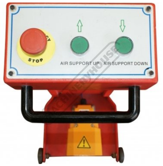
Pneumatic Sheet Support and Emergency Stop on Mobile Foot Control