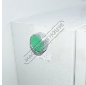
Rear Guard Reset Button