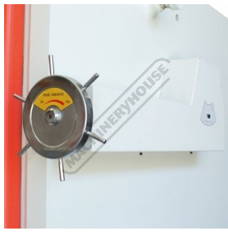
Blade Clearance Adjustment Handle Thickness of Plate Indicator