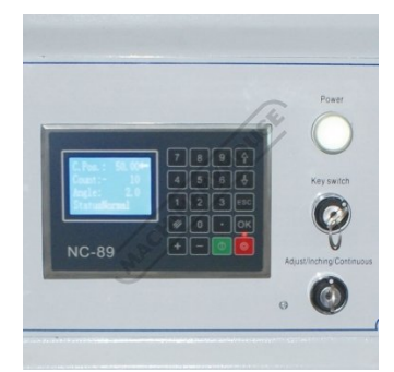
Ezy Set NC 89