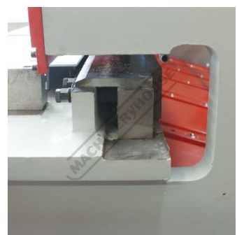
Open Throat for Slitting