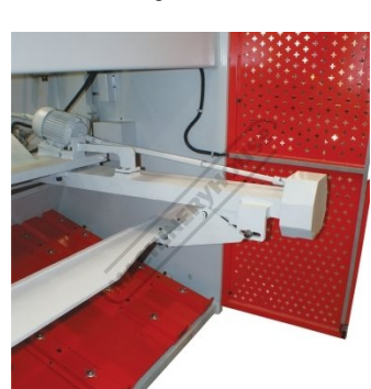
Motorised Backgauge System