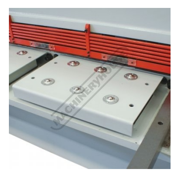
Material Transfer Balls