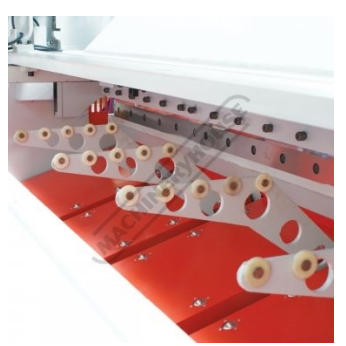
Shown with Optional Pneumatic Sheet Supports