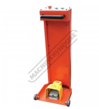
Mobile Foot Control