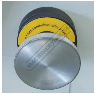
Fine Adjustment Dial for Backgauge