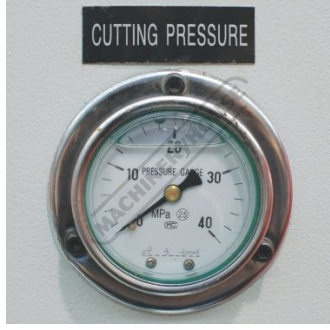
Cutting Pressure Gauge