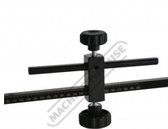
Adjustable Cut Length Stop