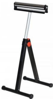
W343 Roller Stand