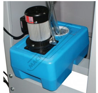
Coolant Pump and Tank