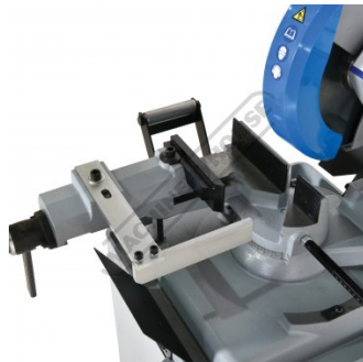
Adjustable Vice Jaws