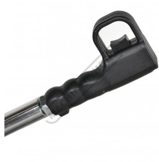
Deadman Trigger Switch