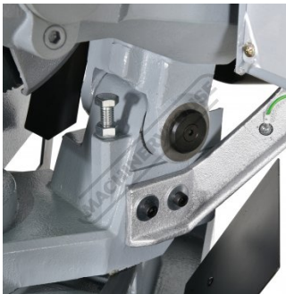
Heavy Duty head Pivot Hinge