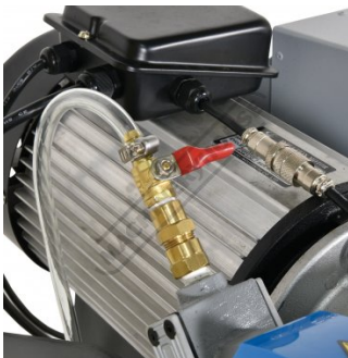
Collant Flow Control Valve