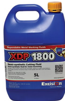
S090 Soluble Metal Cutting Fluid - 5 Litre