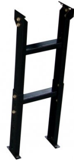
L814 Roller Conveyor Stand