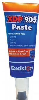
S075 Cutting Tool Lubricant Paste - 200g