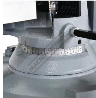
Swivel Head Degree Scale NEW