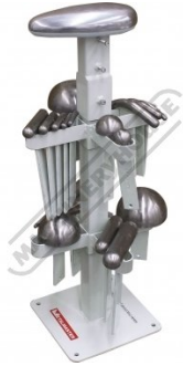
Stand Shown With Optional Dollies