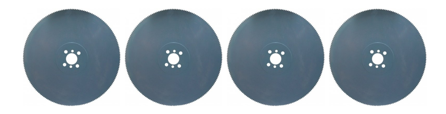
S161E HSS Cold Saw Blade