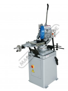
Dual Mitre Head