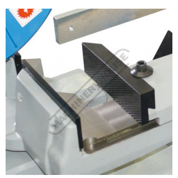
Adjustable Vice Jaw