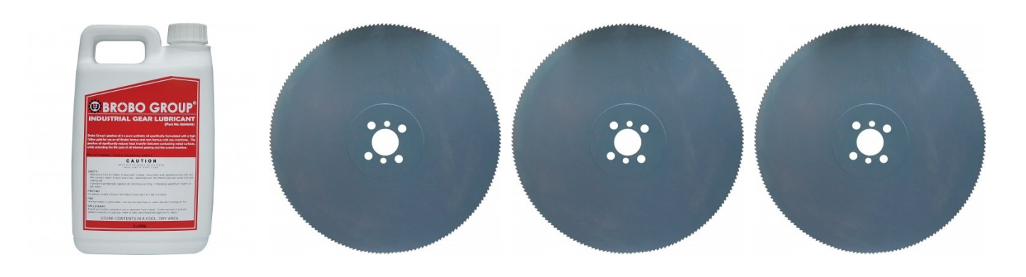
S161C HSS Cold Saw Blade