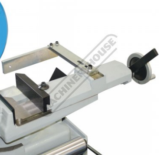
Quick Action Vice