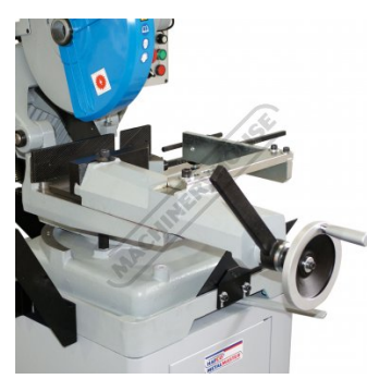
Quick Lock Vice