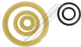
Includes Seal Kit