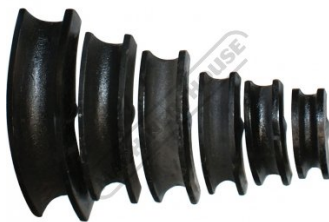
Includes 6 Formers