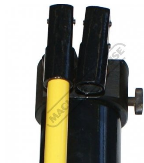
2 Stage Pump