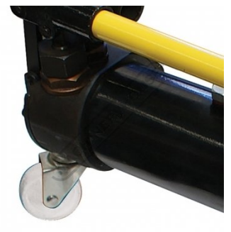
Portable on 3 Castor Wheels