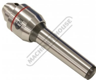
Live Centre Rear View