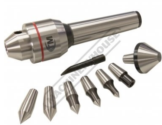
Set Shown With Tips