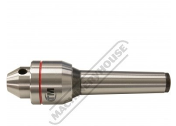
Live Centre Side View