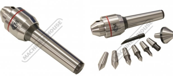
Live Centre Rear View