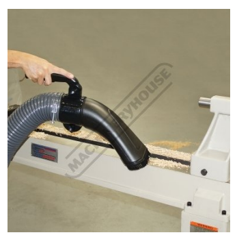
Shown in use