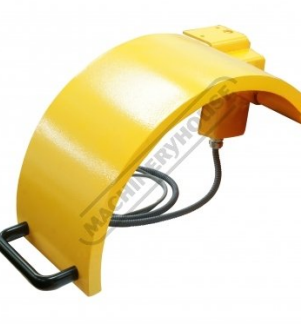
Shown in the up position