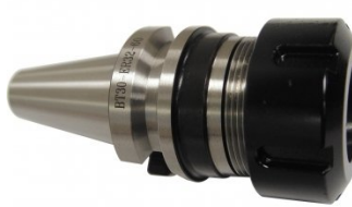
T220 BT40 x ER32-70 Collet Chuck