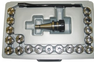
C929 Collet & Chuck Set - 20 Piece