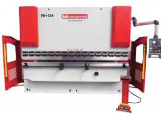
S908GL Hydraulic NC Pressbrake