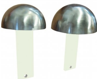
S2236 Oval Steel Dolly