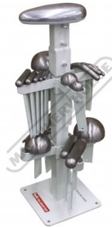
Stand Shown With Optional Dollies