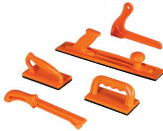
W309 Safety Push Blocks & Stick Set