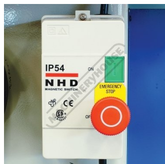
Magnetic Safety Switch