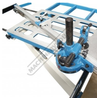
Sliding Table with Mitre Guide and Material Clamp