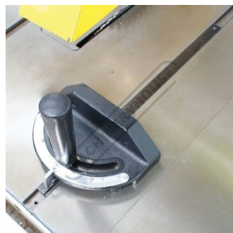
Heavy Duty Mitre Guide 60 degrees