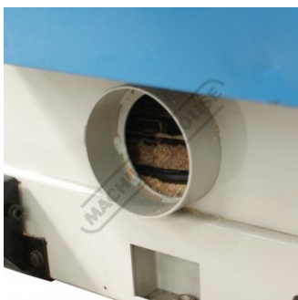
100mm Dust Chute