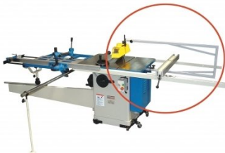
W459 Saw Guard Hood