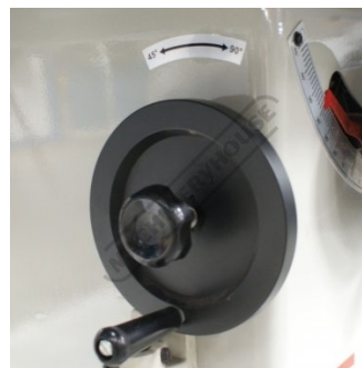
Tilt Arbor to 45 degrees