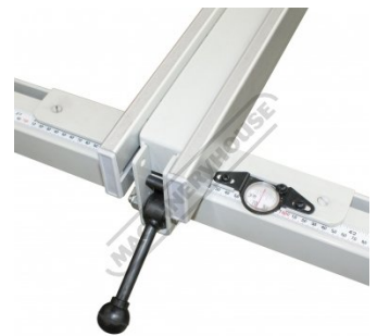
Single Lock Lever on Rip Fence with Magnified Scale