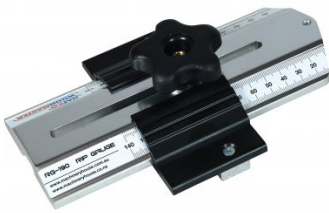
W311 Ripping Gauge