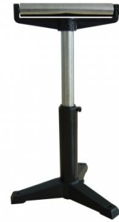
W3434 Roller Stand