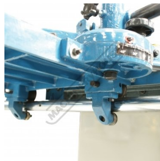
Heavy Duty Ball Bearing Table Slides