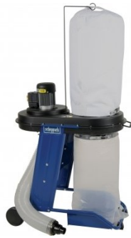
W886 Dust Collector