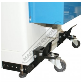
Swivel Wheels on Mobile Base with Leveling Screws