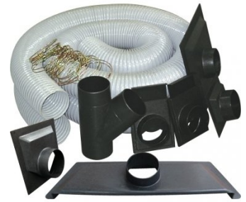
W344 Wood Dust Accessory Kit