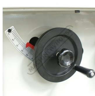
Blade Height Adjustment Handle and Angle Scale