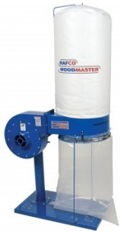
W332 Dust Collector