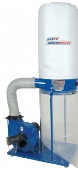
W394 Dust Collector