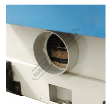
100mm Dust Chute