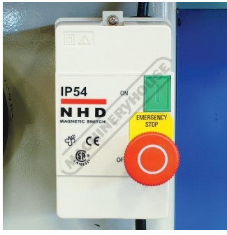
Magnetic Safety Switch