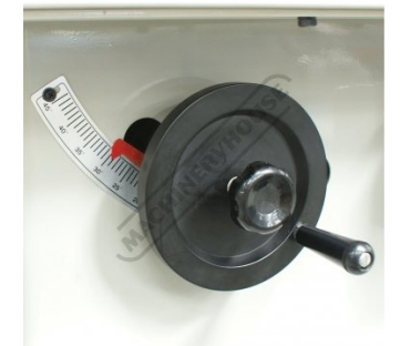
Blade Height Adjustment Handle and Angle Scale