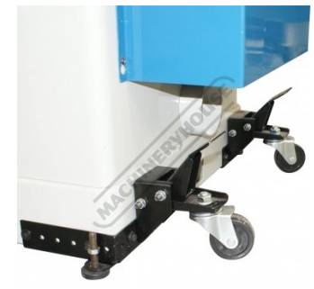
Swivel Wheels on Mobile Base with Leveling Screws