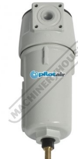
Refrigerated Air Dryer Post Filter 2