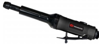
A041 Air Die Grinder - Extended Shaft 5" (127mm)