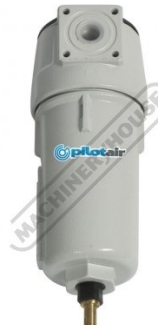
Refrigerated Air Dryer Pre Filter