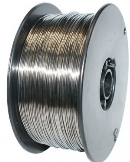
W145A Ø0.9mm Gasless Mild Steel MIG Welding Wire