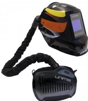
W159 Auto Darken Welding Helmet with PAPR Respiratory System - 5-9, 9-13 Shade