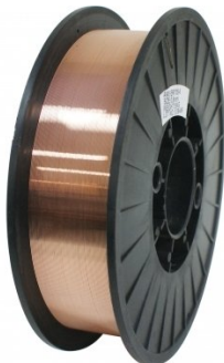
W142 Ø0.9mm Mild Steel MIG Welding Wire