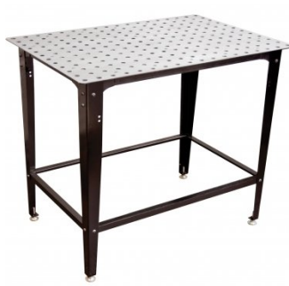
W07700 FixturePoint Welding Table