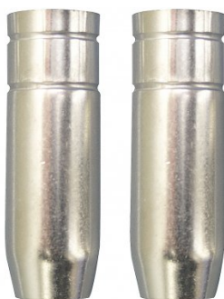
W535 2 x Conical Nozzles