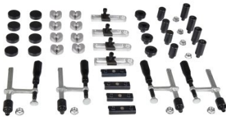
W08500 Square & Round Welding Table Clamp Kit