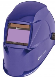
W002 Auto Darken Welding Helmet - 9-13 Shade