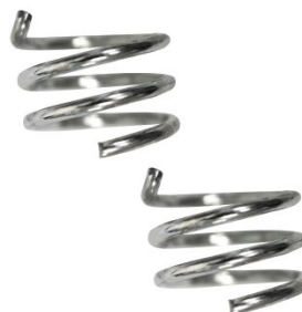
W536 2 x Shroud Springs