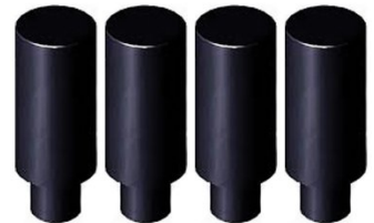
W08515 38mm Material Stop (Spigot Type)