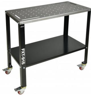
W08450 FIXTURE TABLE