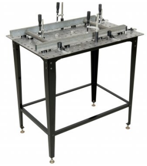
W07706 Welding Table with Square & Round Tube Clamp Kit