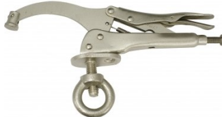
C103 9" Drill Press Locking Clamp