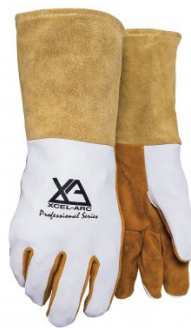
W101 TIG Welding Gloves - 310mm