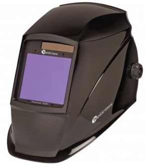
W003 Auto Darken Welding Helmet - 5-8 / 9-13 Shade