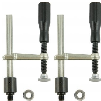
W08510 2 x Weld Clamps with Locking Nuts