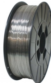
W145B Ø0.8mm Gasless Mild Steel MIG Welding Wire