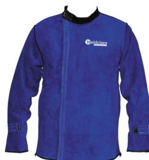
W1002A Professional Promax BL7 Welding Jacket