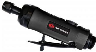
A040 Air Die Grinder