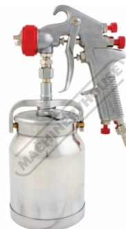
S325 Suction Spray Gun & Pot