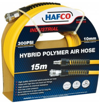
H008 Industrial Polymer Air Hose