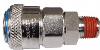
F941 High-Flow One Touch System Air Fittings