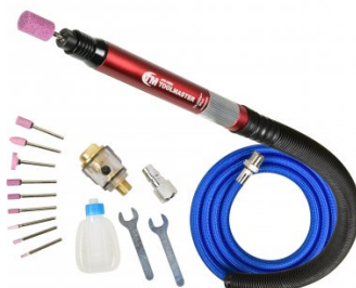
A043 Air Micro Die Grinder Kit