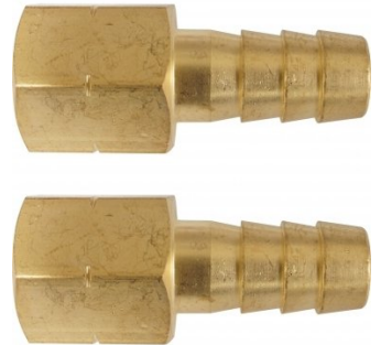
F811 Air Fittings