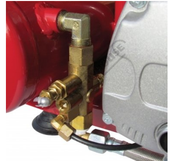
Conrader Control Valve