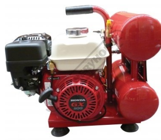
Honda GX200 Motor