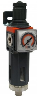
A220 Air Filter Regulator