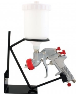
S326 Gravity Feed - Spray Gun