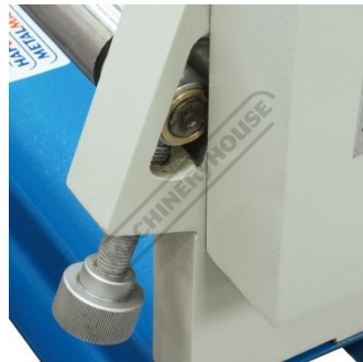
Adjustable Rear Curving Roller