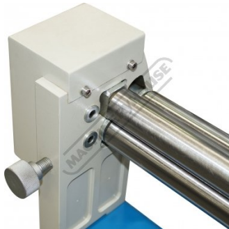
Drive Gear Reduction