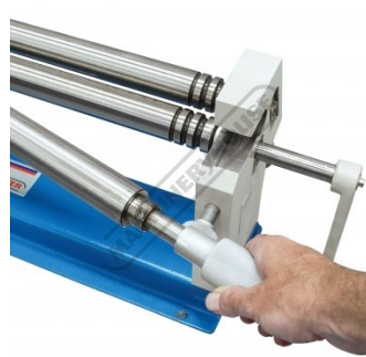
Swivel Top Roller