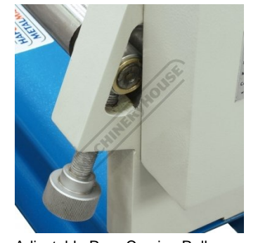
Adjustable Rear Curving Roller