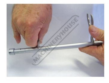
Shown Fitted with Extension Rod