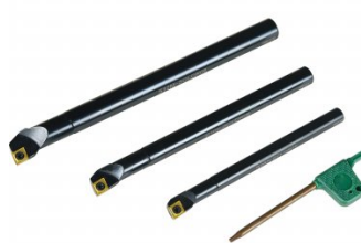
L431 Boring Bar Set - Carbide Insert