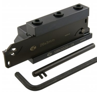
L467 Professional Lathe Parting Tool Kit - Insert Type