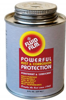
O043 Rust & Corrosion Preventive - Penetrant & Lubrication