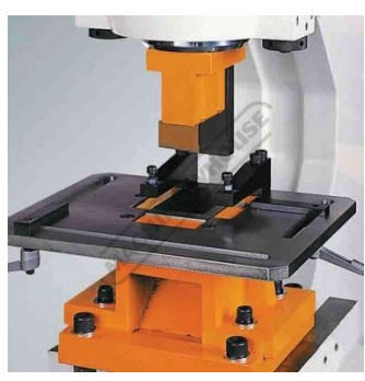
Optional Rectangular Notcher