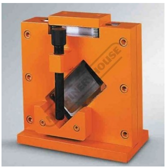
Optional Channel Shearing