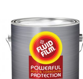
O040 Rust & Corrosion Preventive -Penetrant & Lubrication

Rust & Corrosion Preventive -Penetrant & Lubrication