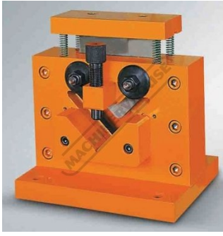
Optional Angle Shearing