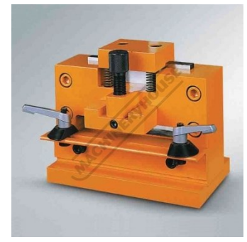
Optional Flat Bar Shearing