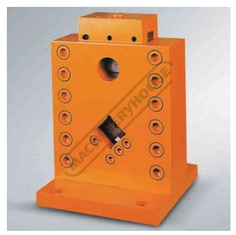
Optional Bar Shearing