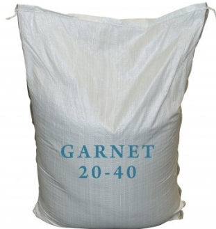
S295 Sandblasting Beads - Garnet