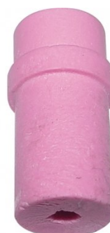
6SC0060 NOZZLES 5.0MM PKT 2