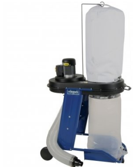
W886 Dust Collector