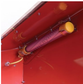
Internal Low Voltage Light