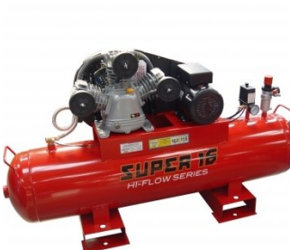
C345 Air Compressor