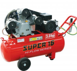
C342 Air Compressor