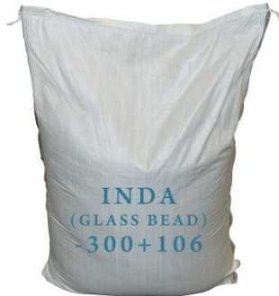
S297 Sandblasting Beads - Inda