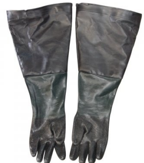
2SC0035 GLOVES PAIR