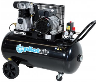
C5051 Pilot Air Compressor