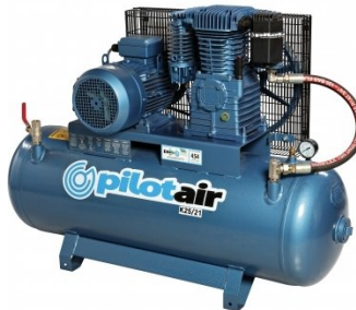
C521 Industrial Pilot Air Compressor