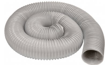
W398 PVC Dust Hose (Sold Per Metre)