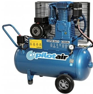
C511 Pilot Super Duty Air Compressor