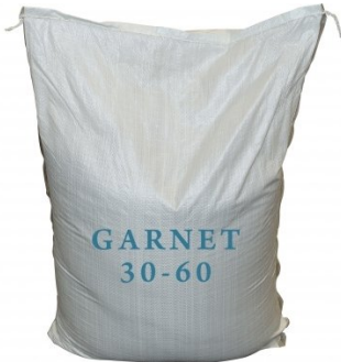
S296 Sandblasting Beads - Garnet