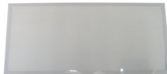
SC004 PVC SHEET PKT 5