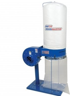
W332 Dust Collector