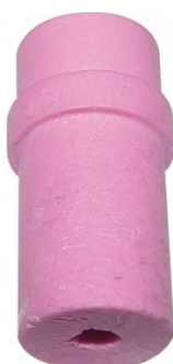
6SC0059 NOZZLES 4.5MM PKT 2