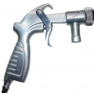
6SC0042 SANDBLASTING GUN