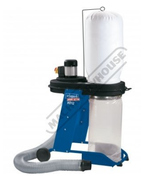
Recomended To Be Use With A Dust Collector