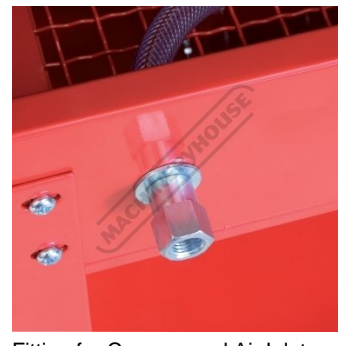
Fitting for Compressed Air Inlet