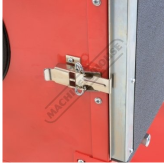
Latch Lock to Side Door