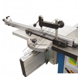
Includes Sliding Table