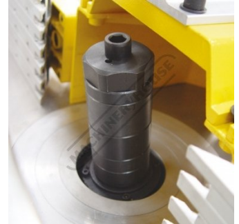
30mm Tilting Spindle