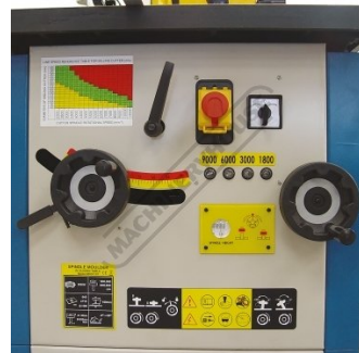
Spindle Adjustment Controls