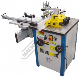
Sliding Table with Mitre Guide & Top Clamp