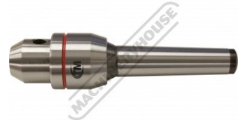
Live Centre Side View