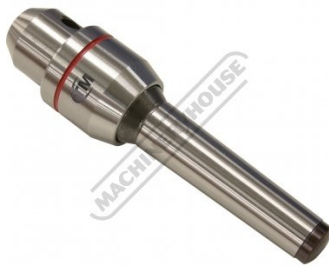
Live Centre Rear View