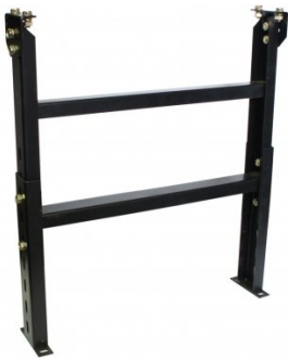
W343 Roller Stand