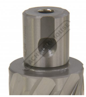
Universal Shank Rear Side