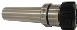
C931 32 x 100 x ER32 Collet Chuck - Straight