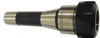
C106 Collet Chuck - R8 x ER32