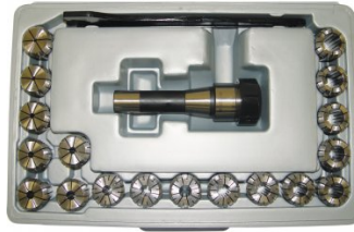
C927 Collet & Chuck Set - 20 Piece