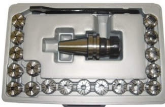
C929A Collet & Chuck Set - 20 Piece