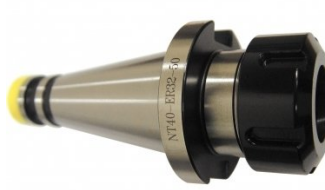
C112 Collet Chuck NT40 - ER32