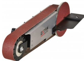
L085 Multitool Belt & Disc Linishing Attachment