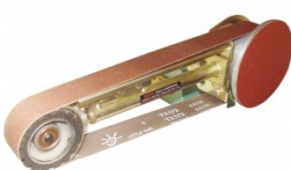
L089 Multitool Belt & Disc Linishing Attachment