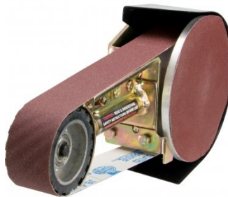
L087 Multitool Belt & Disc Linishing Attachment