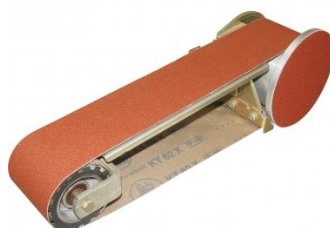
L090 Multitool Belt & Disc Linishing Attachment