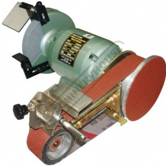
Shown mounted on a Optional Bench Grinder