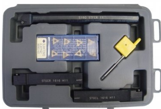
L452 Lathe Turning Tool Kit - 3 piece Insert Type