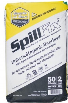
O000 SpillFix Universal Organic Absorbent