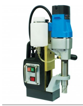
13/07/2023 7:02 AM