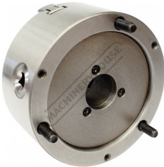
Chuck Rear View