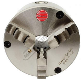
Chuck Front View