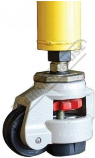
Shown attached to Leg